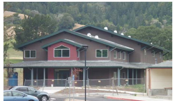
Napa Valley Language Academy Napa

New Gymnasium with attached two-story offices and locker area totaling 11,000sf.