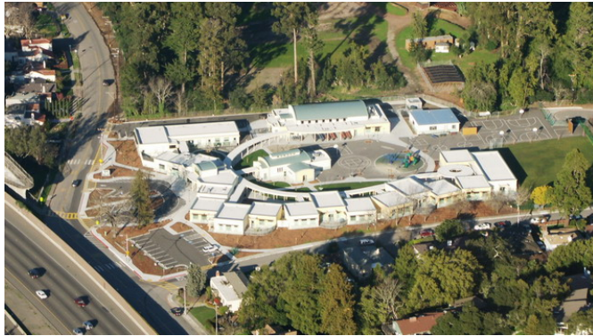
Coleman Elementary School San Rafael