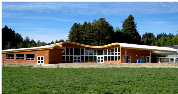
Salmon Creek Eco-Resource Building Occidental

New 5,420sf LEED Platinum Multi-Use Building.